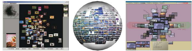
Figure 1: Example multimedia exploration systems

In the presence of ever-increasing multimedia databases, supporting users in getting access and insight into such large databases remains a challenging issue. For this purpose, content-based retrieval approaches [9, 12, 15] support users in searching and finding particular objects or topics in a content-based way by providing them with a static database's subset of potentially relevant objects with respect to their information needs. In this way, those approaches can only be successful when the users' information needs are clearly specified. When these information needs are imprecise or even unknown, relevance feedback techniques [27, 19] may assist the user to refine the search process and help him or her to find the desired content. However, refining the search process and, thus, sharpen the user's information need by means of relevance feedback techniques is less useful when he